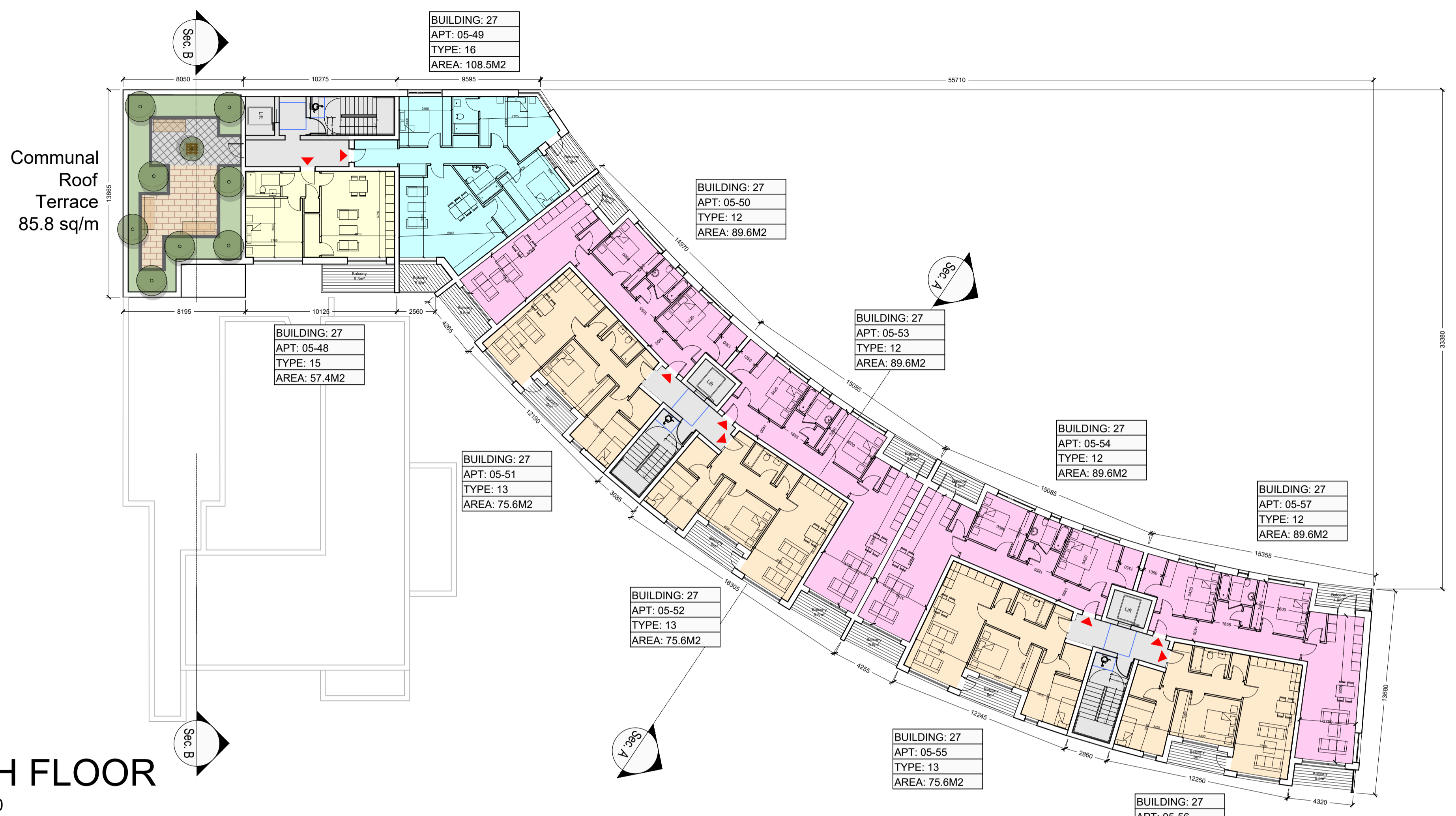
FIFTH FLOOR Scale 1:200